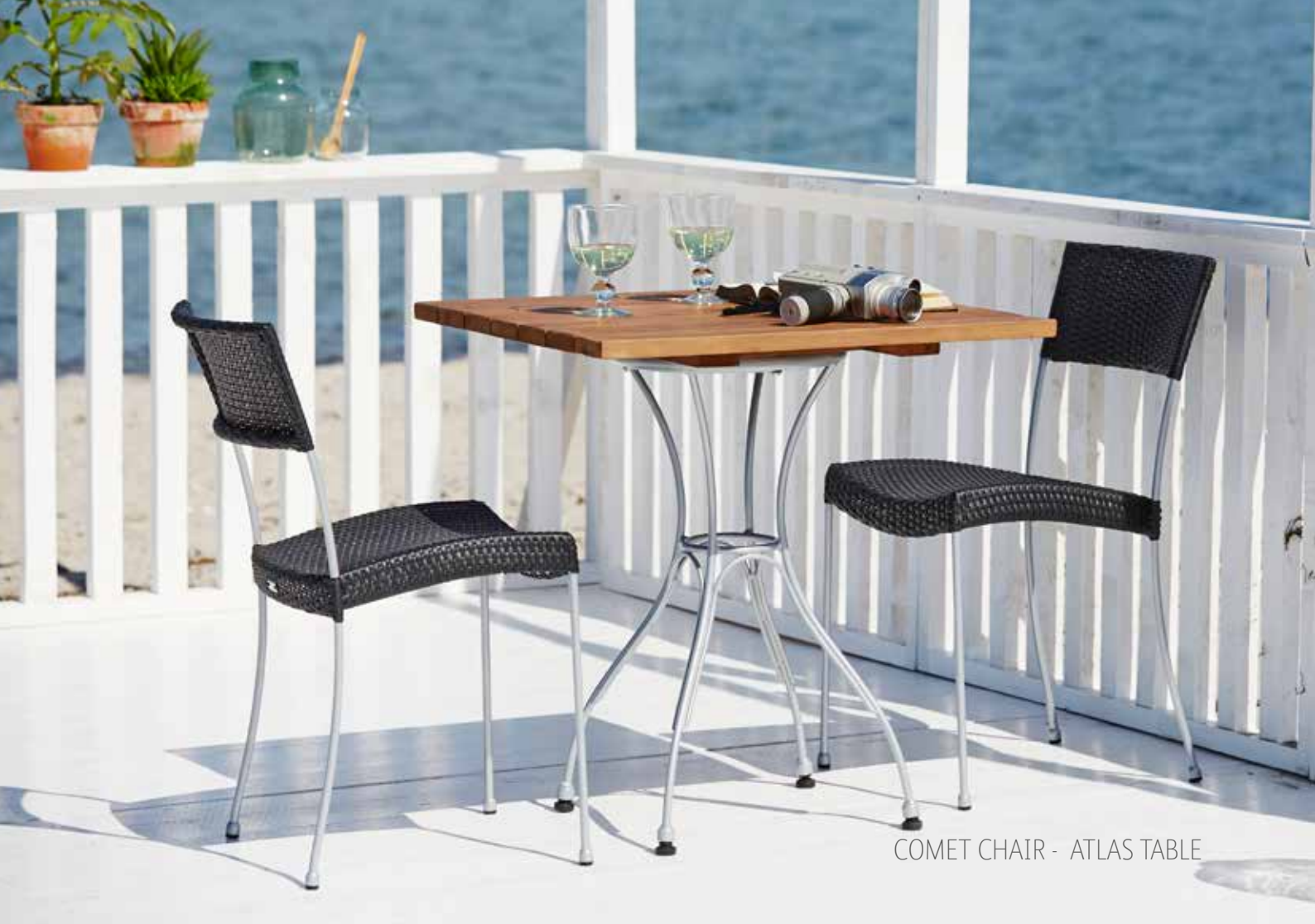
COMET CHAIR - ATLAS TABLE