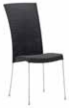
SATURN - 9100 W46 D62 H97 SH 45 ● ● ⌘