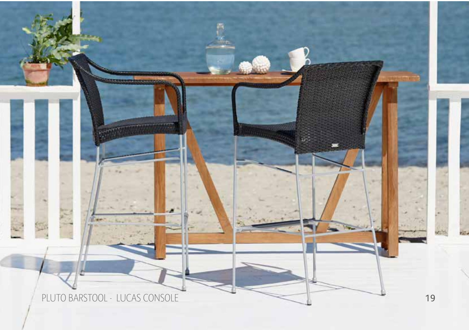
PLUTO BARSTOOL - LUCAS CONSOLE