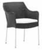
VENUS - 9150 W63 D58 H82 SH46 ● ● ⌘