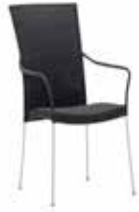
SARURN - 9101 W54 D62 H97 SH 45 ● ● ⌘