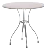
ATLAS - 9404 Ø60/80 H73