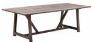
GEORGE TABLE 9440U - L200 H72,5 D100