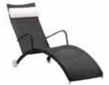
HELENA - 9230 W63 D165 H99 SH34 ● ● ⌘