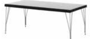
JUPITER - 9401 W90 L180 H73 ● ●