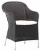
ATHENE - 9140 W60 D58 H80 SH 41 ● ●