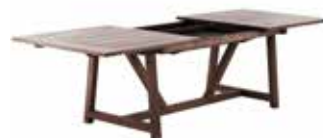
GEORGE EXT. TABLE 9480U - L200 (280) D100 H72,5