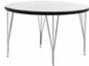
JUPITER - 9412 Ø120 H73 ● ●