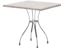
ATLAS - 9404 W70/80 L70/80 H73