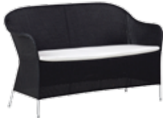
ATHENE - 9245 W60 D58 H80 SH 41 ● ●