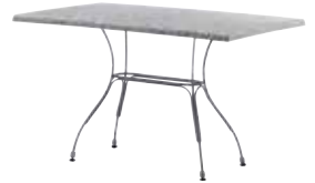
ATLAS - 9403 W80 L120 H73