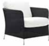
ORION - 9130 W75 D75 H75 SH 44 ● ●