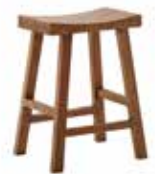
CHARLES COUNTER STOOL 1054D - W50 H68 D40 SH66

The color „Weathered Teak Grey“ is not solid and will age/wear like a pair of jeans and have the cool effect of patinised teak.