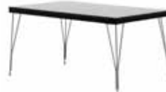
JUPITER - 9407 W90 L150 H73 ● ●