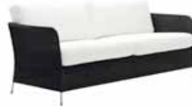
ORION - 9230 W195 D75 H75 SH 44 ● ●