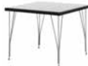
JUPITER - 9400 W90 L90 H73 ● ●