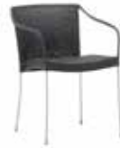
PLUTO - 9160 W58 D55 H74 SH 45 ● ● ⌘