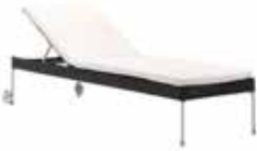
MARS - 9550 W60 L190 H36 ● ●