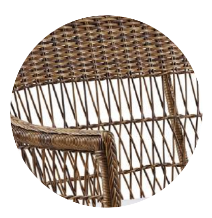
COLOUR CODE C = CHESTNUT