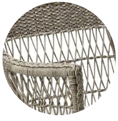
COLOUR CODE T = ANTIQUE

Georgia Garden is made of strong and maintenance-free synthetic fibers in vintage white, antique or chestnut colour woven on aluminium frames.