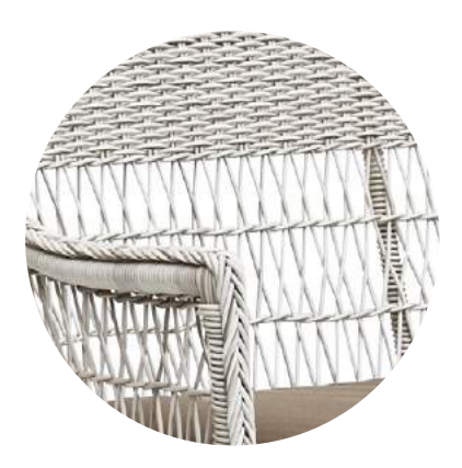
COLOUR CODE X = VINTAGE WHITE