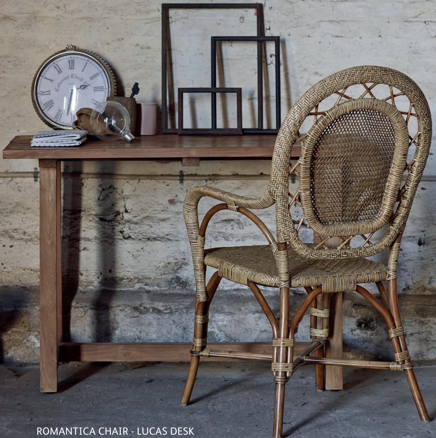
ROMANTICA CHAIR - LUCAS DESK