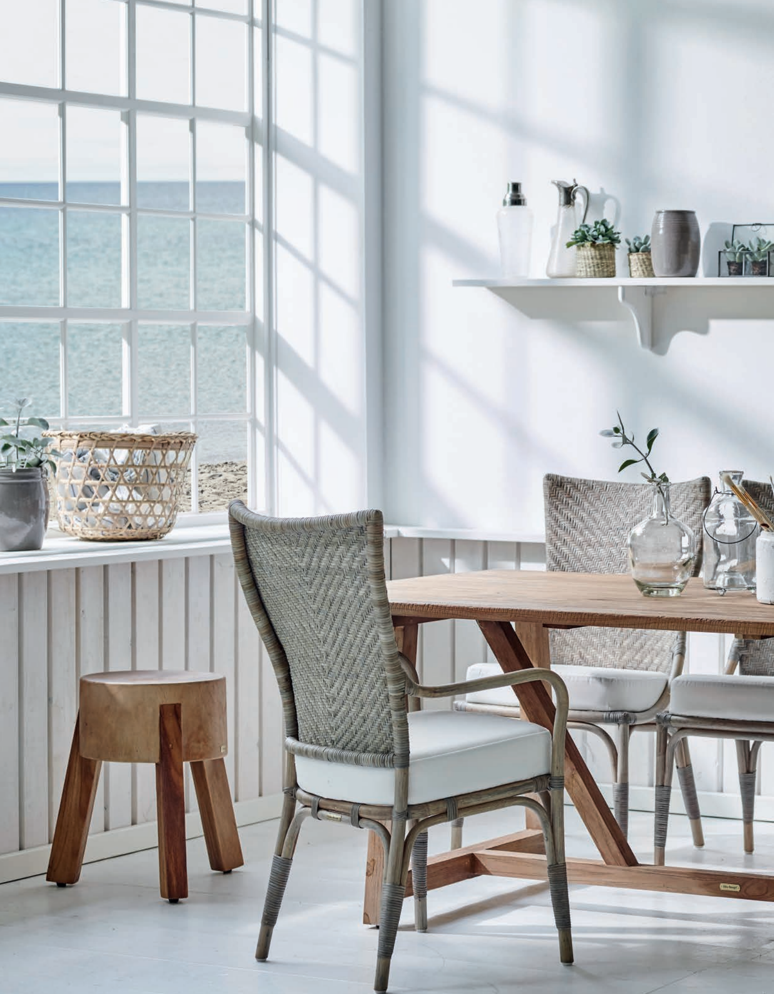
MELODY ARMCHAIR - MELODY CHAIR - LUCAS TABLE - ROGER STOOL