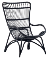
MONET CHAIR - 1082S W67 D81 H98 SH40