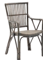
PIANO CHAIR - 1012T W54 D62 H93 SH45 AH65