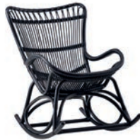
MONET ROCKING CHAIR - 1081S W69 D99 H93 SH45