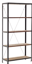
SHELLY SHELVES - 4055D W100 D40 H211