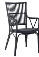
PIANO CHAIR - 1012S W54 D62 H93 SH45 AH65