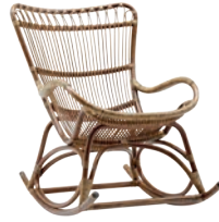
MONET ROCKING CHAIR - 1081A W69 D99 H93 SH45