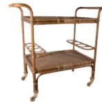
CARLO BAR TROLLEY - 4027A W87 D45 H82