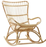
MONET ROCKING CHAIR - 1081U W69 D99 H93 SH45