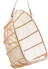
RENOIR SWING - 3080U W75 D68 H113