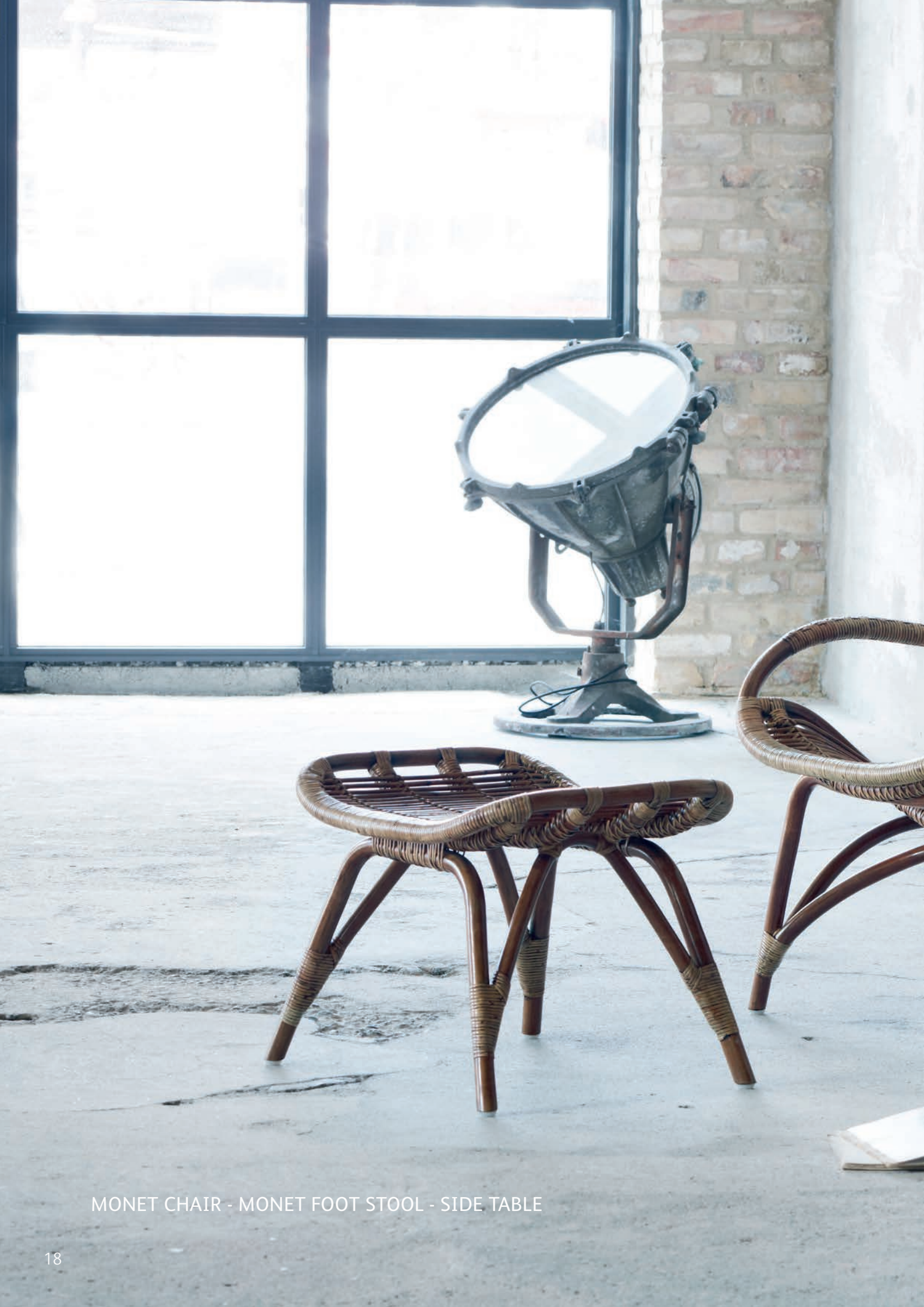
MONET CHAIR - MONET FOOT STOOL - SIDE TABLE