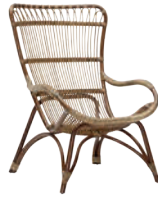
MONET CHAIR - 1082A W67 D81 H98 SH40