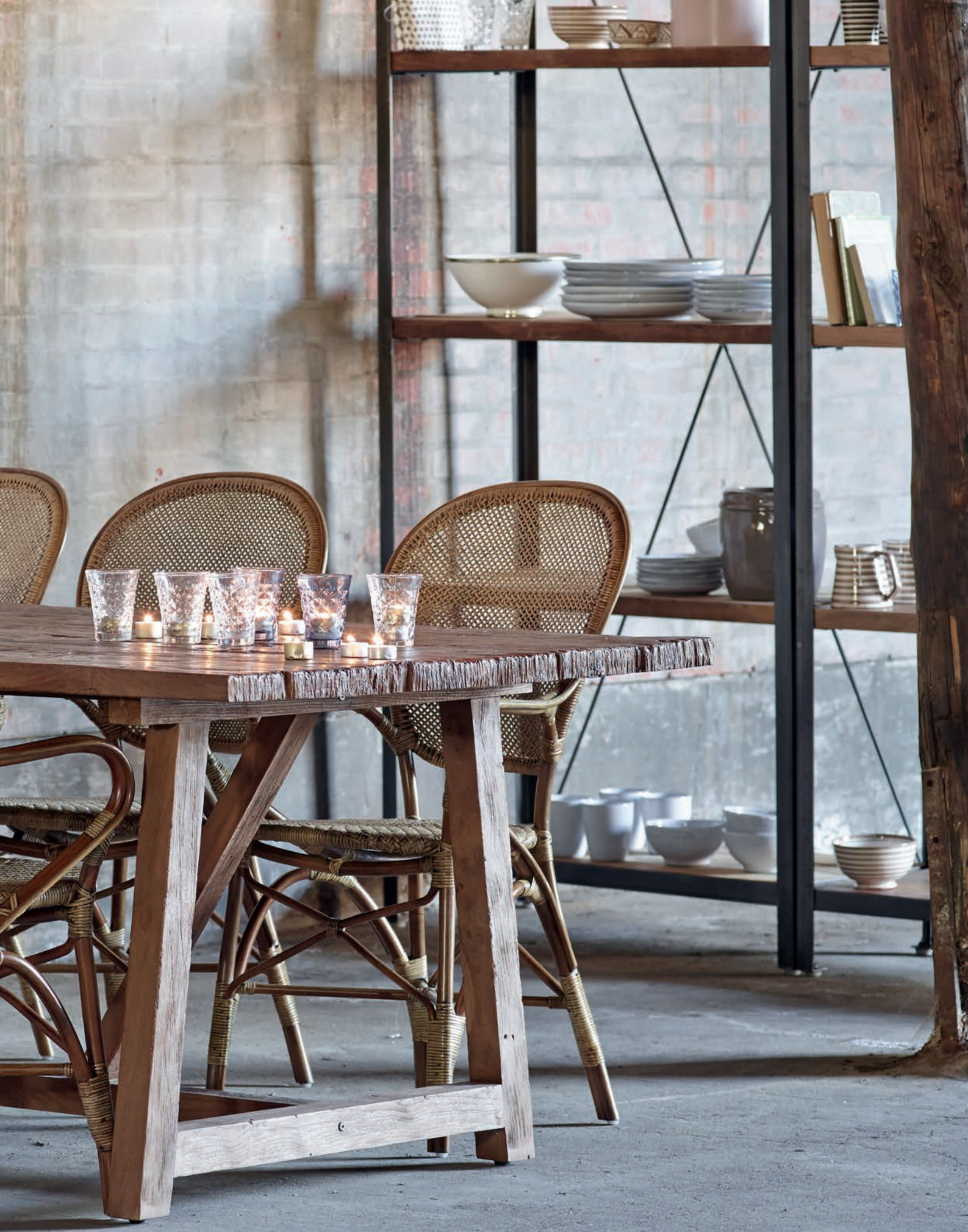
ROSSINI CHAIR - LUCAS DINING TABLE - SHELLY SHELVES