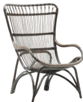
MONET CHAIR - 1082T W67 D81 H98 SH40