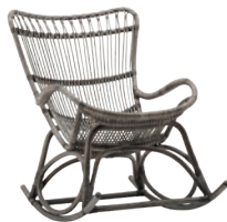
MONET ROCKING CHAIR - 1081T W69 D99 H93 SH45