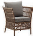
DONATELLO CHAIR - 1086A W73 D72 H75 SH46