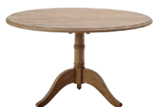
MICHEL TABLE - 9452D Ø120 H72