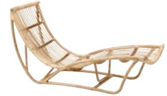
MICHELANGELO DAYBED - 1025U L162 W62 H77