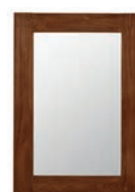
LUCAS MIRROR - 4970D W70 H100