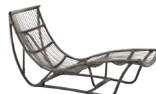
MICHELANGELO DAYBED - 1025T L162 W62 H77