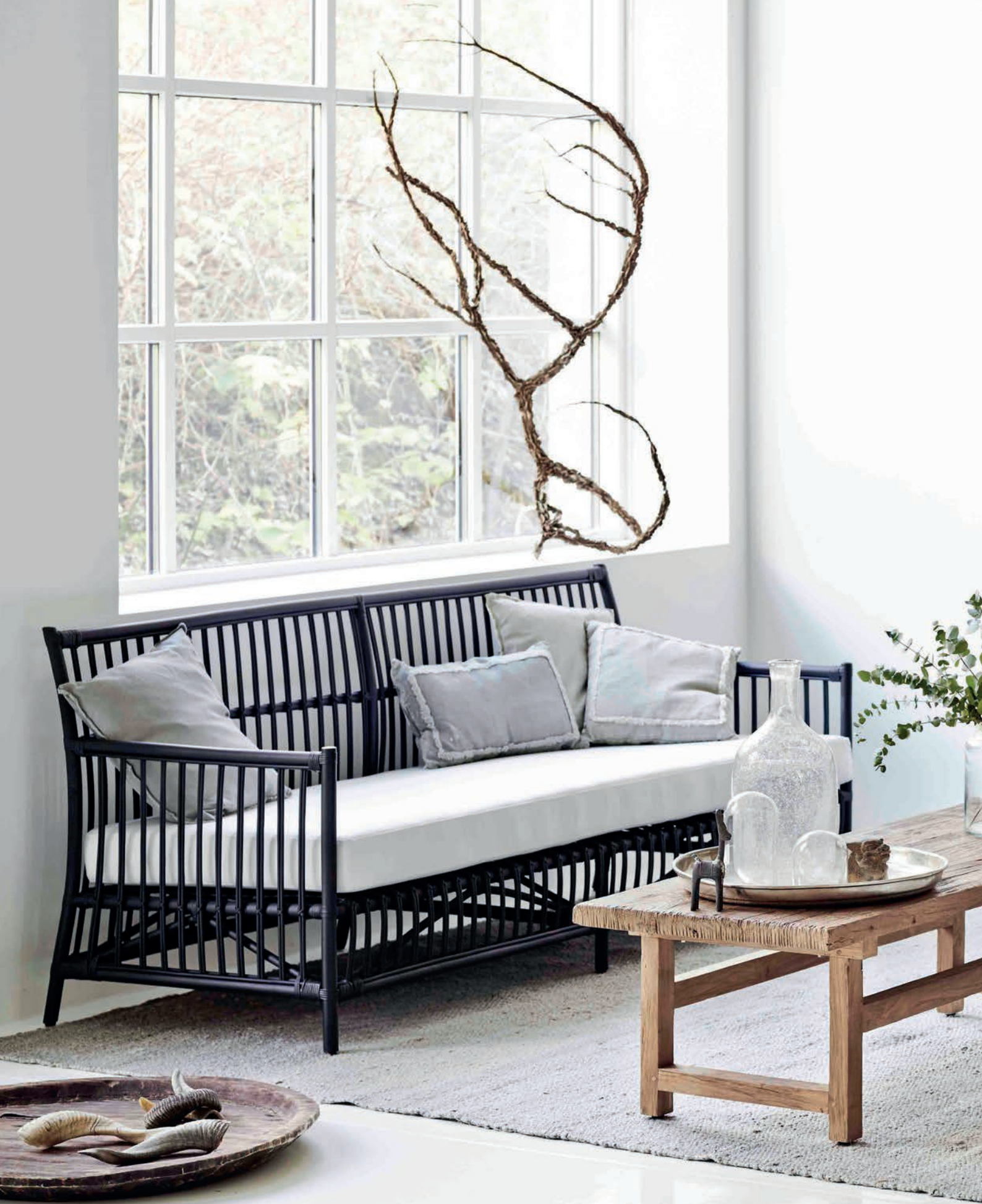
CAROLINE 3 SEATER - CAROLINE CHAIR - AFRED TABLE - SHELLY SHELVES