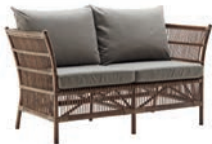
DONATELLO 2-SEATER - 2086A L145 D72 H75 SH46