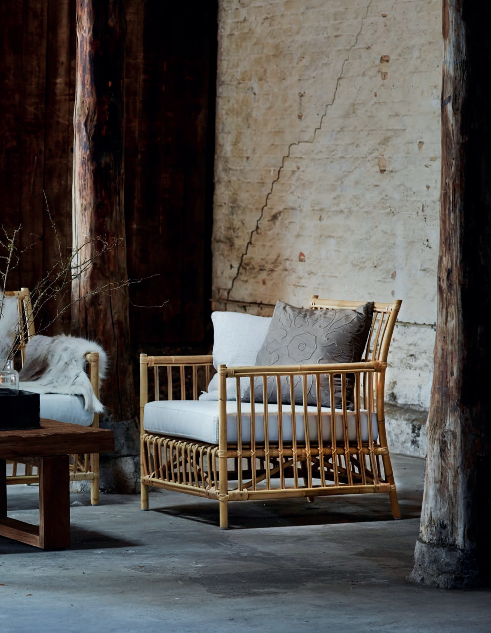
CAROLINE 3 SEATER - CAROLINE CHAIR - ALEXANDER COFFEE TABLE