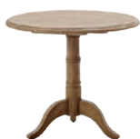
MICHEL TABLE - 9458D Ø80 H72