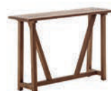
LUCAS CONSOLE - 9471D L140 D40 H90