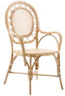
ROMANTICA CHAIR - 1015U W60 D61 H100 SH45 AH65