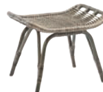
MONET FOOT STOOL - 1084T W53 D42 H40