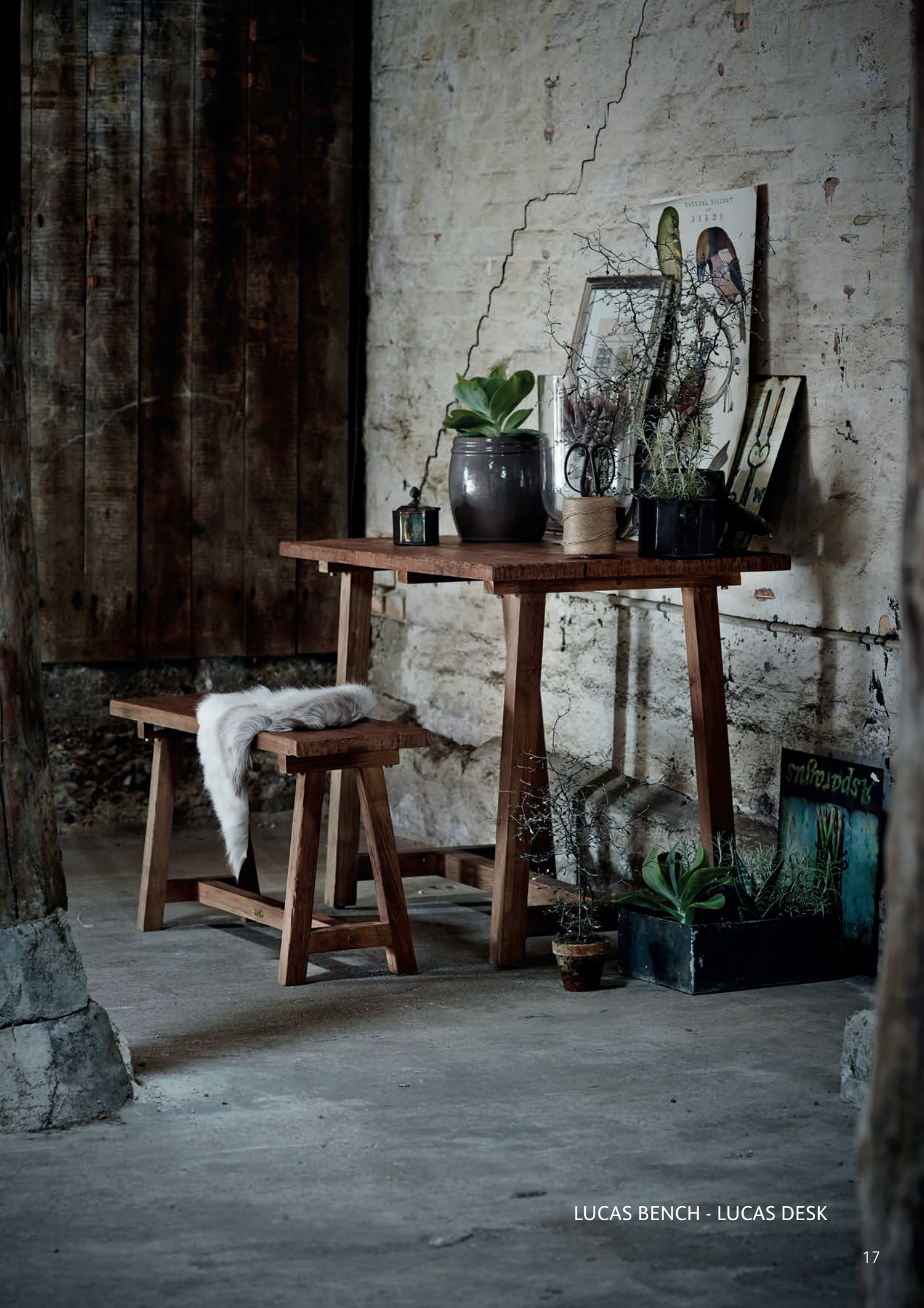
LUCAS BENCH - LUCAS DESK