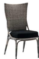
MELODY SIDE CHAIR - 1067T W54 D60 H97 SH47