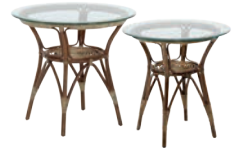
CAFÉ TABLE - SIDE TABLE 4007A Ø80/100 H70 4005A Ø60 H60