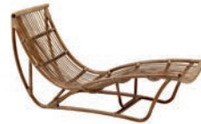
MICHELANGELO DAYBED - 1025A L162 W62 H77