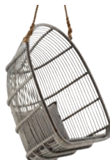
RENOIR SWING - 3080T W75 D68 H113