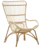
MONET CHAIR - 1082U W67 D81 H98 SH40