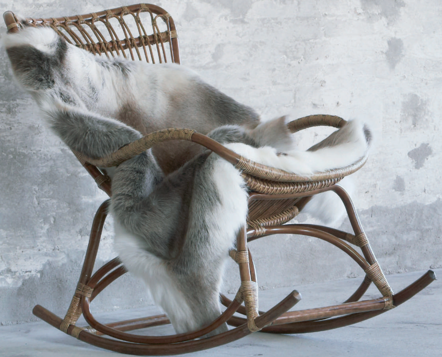
MONET ROCKING CHAIR