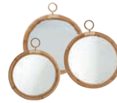
ELLA MIRROR - 5050SU - 5045SU - 5040SU Ø50 - Ø45 - Ø40