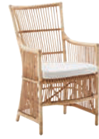
DAVINCI CHAIR - 1005U W56 D54 H99 SH51 AH68