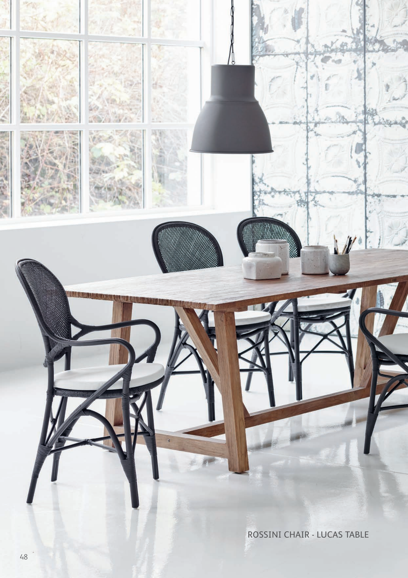
ROSSINI CHAIR - LUCAS TABLE