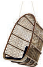
RENOIR SWING - 3080A W75 D68 H113