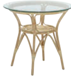
CAFÉ TABLE - 4007U Ø80/100 H70