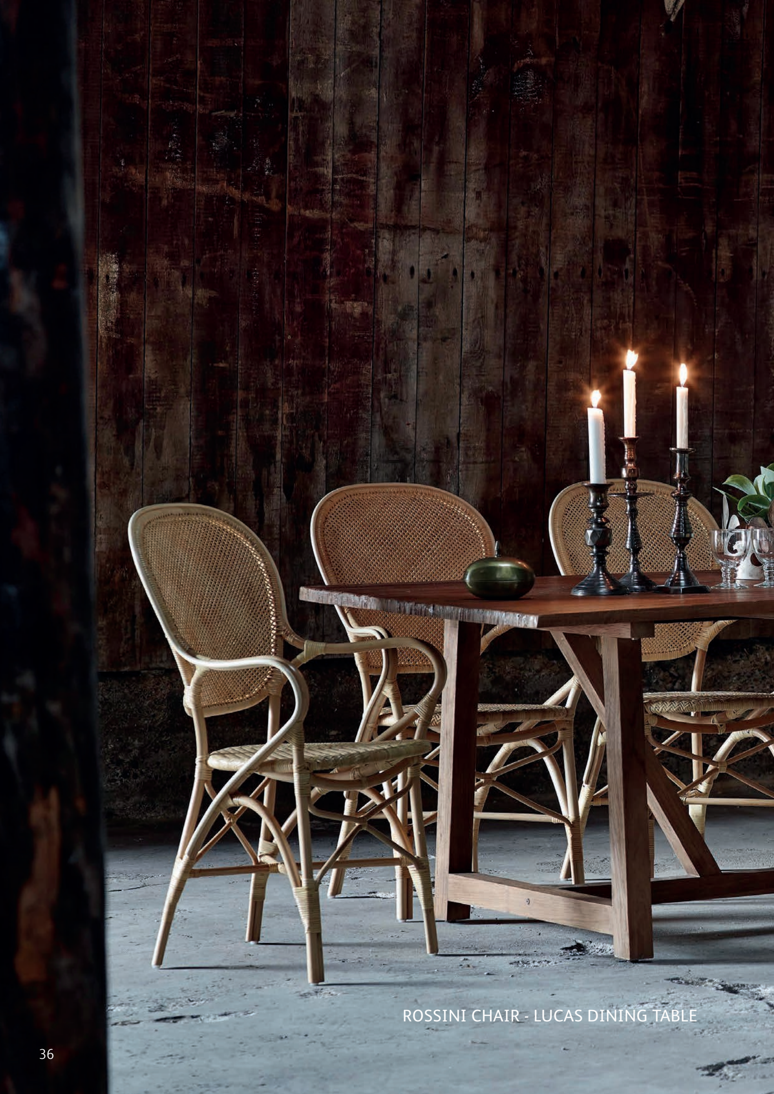
ROSSINI CHAIR - LUCAS DINING TABLE