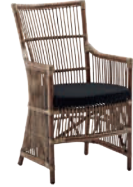
DAVINCI CHAIR - 1005A W56 D54 H99 SH51 AH68